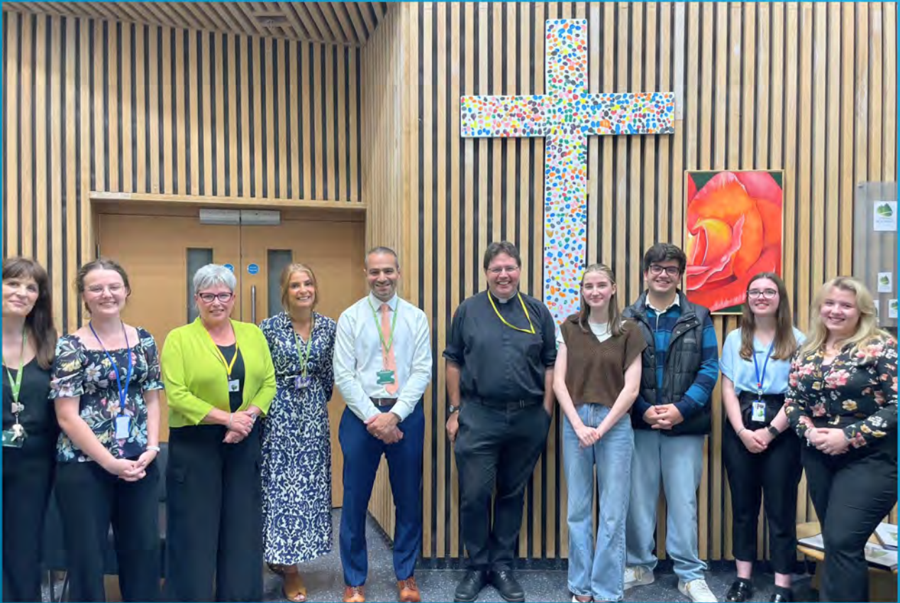
Staff and students at Epping St John's Church of England Secondary School in front of a Pride cross created to affirm all people as being made in the image of God